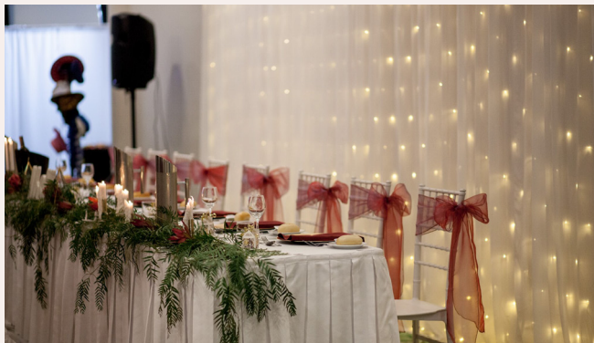
BROKEN BAY BALLROOM