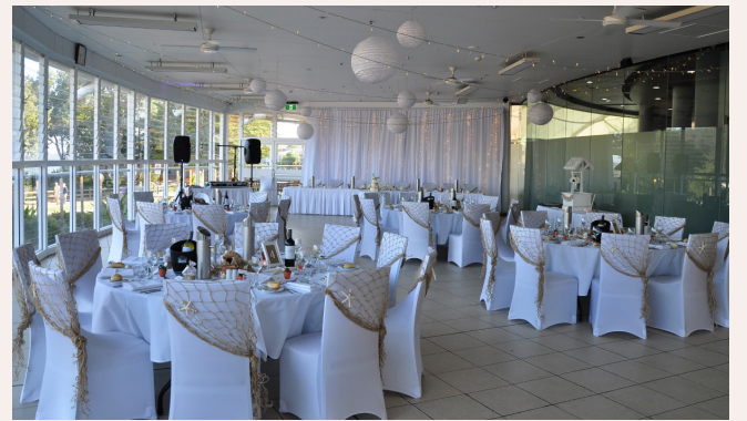
THE PRETTY BEACH ROOM