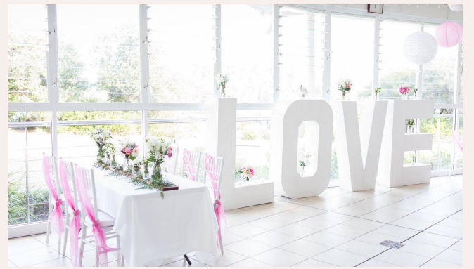
THE PRETTY BEACH ROOM

Features natural light and private entry. Suitable for up to 330 guests, banquet-style.