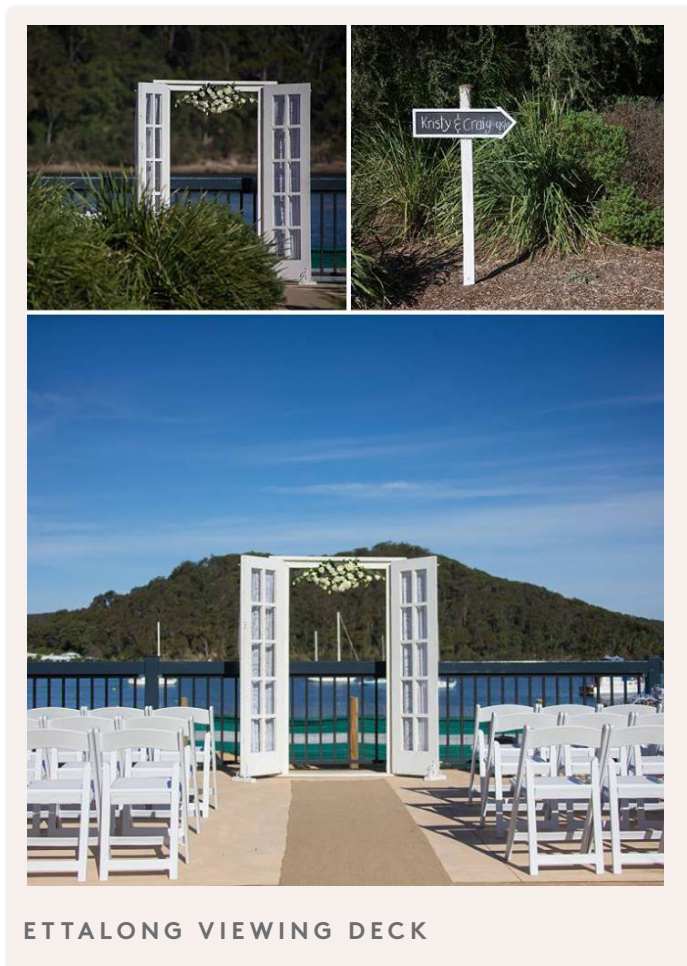
ETTALONG VIEWING DECK