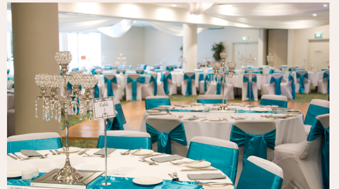
BROKEN BAY BALLROOM